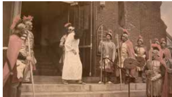
Good Friday Procession and Reenactment, St. Mary of the Annunciation Parish