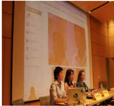
The Most Experimental Storytellers

To mark the fifth anniversary of NeighborMedia, in collaboration with the Digital Media Law Project and Cyberlaw Clinic at Harvard's Berkman Center for Internet and Society and MIT's Center for Civic Media and Comparative Media Studies , CCTV hosted a forum on May 4th at the main branch of the Cambridge Public Library . The half-day forum, Filling the News Gap in Cambridge and Beyond: Citizen Journalism and Grassroots Media , explored the quickly expanding world of citizen journalism. Following shortly after the bombings at the Boston Marathon, the forum was a timely look at the ways that traditional journalism has changed as more people have access to technology and social media tools.