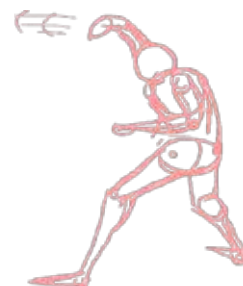
Stop Motion Still by CCTV Animation Trainer

With the right creative elements, a music video can be much more than just a promotional work. It can add layers to a song, interpret it visually, or structure an entire story around it. In this class, we will examine the various forms that a music video may take. Then students will plan, produce, and edit their own music videos, working either alone or in groups. Music may be selected from a variety of royalty-free resources.