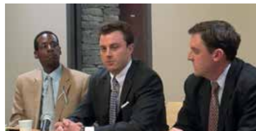
The 8th Suffolk Candidate Forum and Debate, Ward Five Democratic Committee