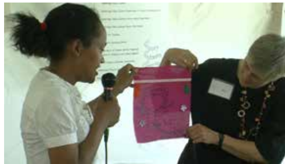
Central Square World Fair