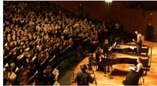
Brahms Requiem Concert at MIT to Benefit Victims of Boston Marathon Bombing