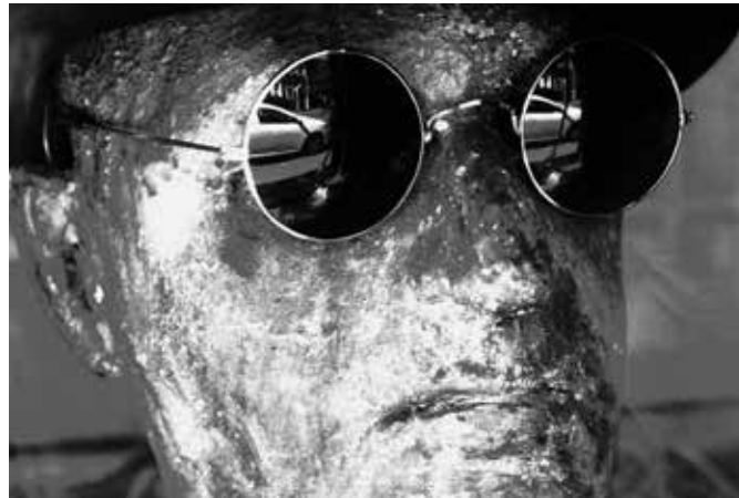
Alternate A by Alan Verly

▶ DSLR STUDENTS CCTV will host a photography exhibition of work created by the