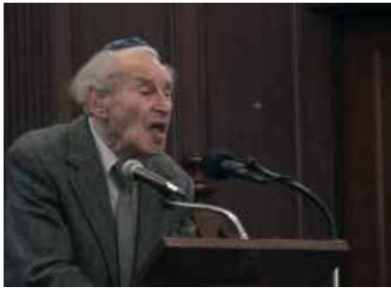
Holocaust Memorial, Yom HaShoah, MIT Hillel

Because many organizations hold events throughout the year that do not get broader media coverage, CCTV provides Organizational members with free event coverage. We strive to produce and feature programming that is pertinent to Cambridge. Over the past three months we have collaborated with the following individuals and organizations to record their events: